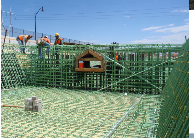
Figure 8 – Span 5 EB CIP Superstructure Construction – July 14, 2010:

The ironworkers make final adjustments to Pier 5 EB diaphragm reinforcing before the bulkhead forms are installed.