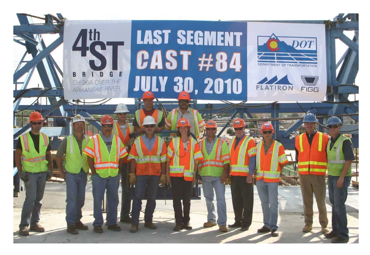
Figure 14 – Cantilever 4 EB Construction – July 30, 2010:

Following the pour, the CDOT Project Team joins Flatiron for a photo in front of the banner for this project milestone.