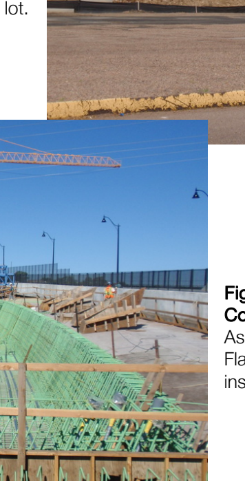
Figure 5 – Span 5 EB CIP Superstructure Construction – July 13, 2010:

The staining subcontractor begins to apply the first coat of stain to Span 5 WB, as seen from the Midtown Mall parking lot.