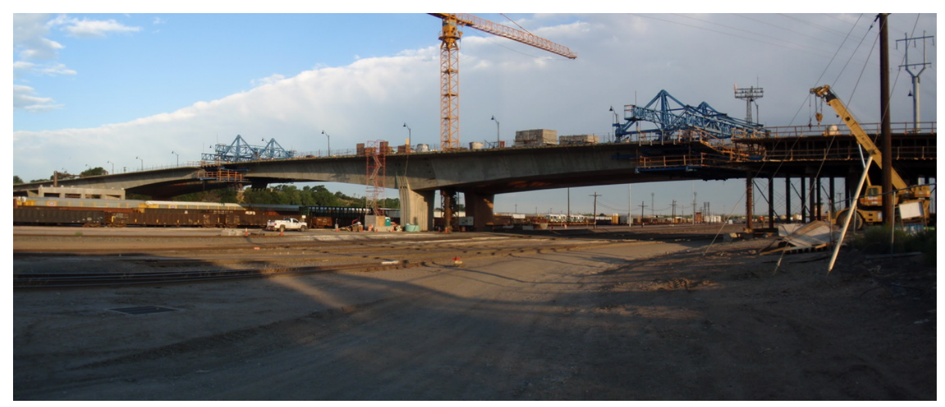
Figure 12 - Cantilever 4 EB Construction - July 20, 2010:

The upstation (right) form traveler approaches Span 5 EB CIP Superstructure. Span 5 EB CIP Superstructure is a critical path activity, since cantilever construction will be complete before the end span is completely cast, stressed, and the falsework removed.