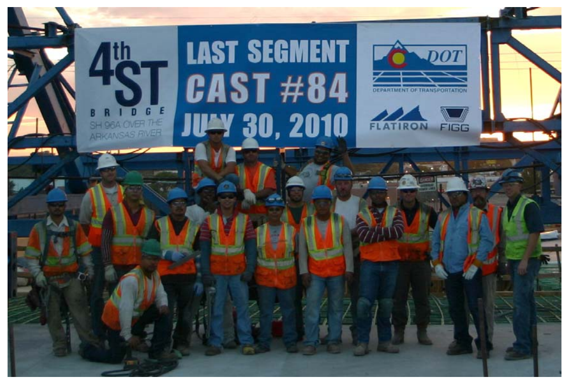
Figure 13 – Cantilever 4 EB Construction – July 30, 2010:

Concrete placement for the webs, bottom slab, and diaphragms nears completion at Span 5 EB CIP Superstructure. Flatiron anticipates casting the top slab in late August, followed by closure pours in September, which will be ahead of schedule.