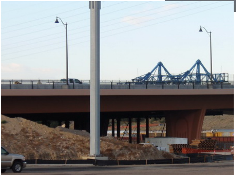
Figure 11 – WB Bridge Staining – July 20, 2010:

Span 5 WB staining is nearly complete, with only the traffic barriers remaining.