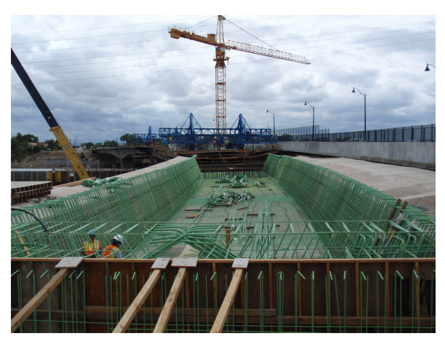
Figure 1 – Span 5 EB CIP Superstructure Construction – July 7, 2010:

Flatiron Constructors Intermountain continued segment production at Cantilever 4 EB and cast Span 5 EB CIP Superstructure bottom slab, webs, and diaphragms. Bridge demolition continued, with one pier remaining within the UPRR property. The following is a summary of the construction progress for the last month.