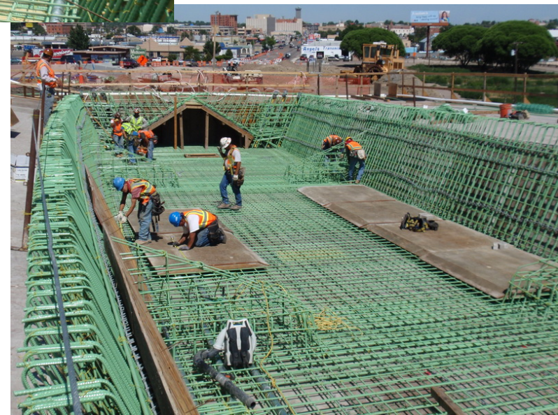
Page 3 of 9

Flatiron workers begin to install the interior web forms at Span 5 EB, as the ironworkers finish the deviator reinforcing installation.