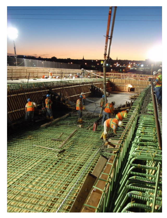
Figure 13 – Span 5 EB CIP Superstructure Construction – July 27, 2010:

The upstation (right) form traveler approaches Span 5 EB CIP Superstructure. Span 5 EB CIP Superstructure is a critical path activity, since cantilever construction will be complete before the end span is completely cast, stressed, and the falsework removed.